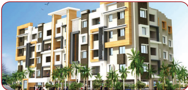
THE EMERALD Laxmisaagar, Bhubaneswar